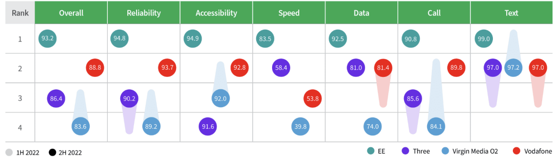
UK-wide RootScores 2H 2022

Here, you can see the RootMetrics H2 2022 results for each of the individual mobile network awards. EE won all awards.